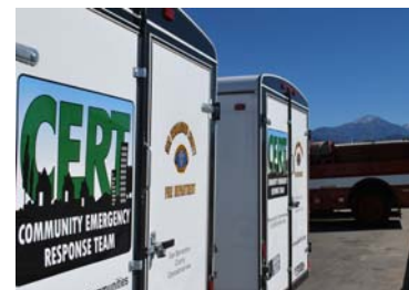
CERT trailers are available for use by any of the CERT programs in the County.