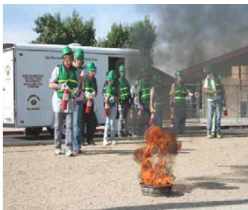
The community of Oak Hills conducted its first CERT training in August/September 2009.